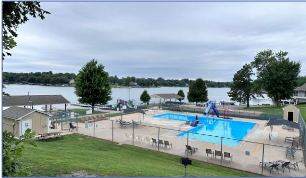
The Swimming Pool Opened 6-26-26